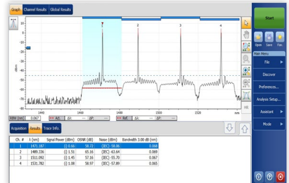
The FTBx-5235 displays channel power, channel wavelength and OSNR. Above: example of CWDM network OSA display. Below: example of DWDM network OSA display.

100 GigE deployments are now commonplace, triggering a transition from 10G and lower rate service (SFP/SFP+XFP) to 40G/100G using CFPs and QSFP28. This is in turn leading to multiwavelength client-side communications instead of single-wavelength transmissions. Since CFPs/QPSF28 have longer reaches (up to 10 km for LR4), meeting the loss budget is more challenging than ever before. Moreover, CFPs and QPSF28 greatly vary in quality, and sizable quantities of pluggables are simply defective. All these trends are calling for CFP/QPSF28 power measurements at the network element, where the client-side signals are converted to line-side signals. The FTBx-5235 is perfectly designed to assess the quality of pluggables in today's context of rapid network transformation.